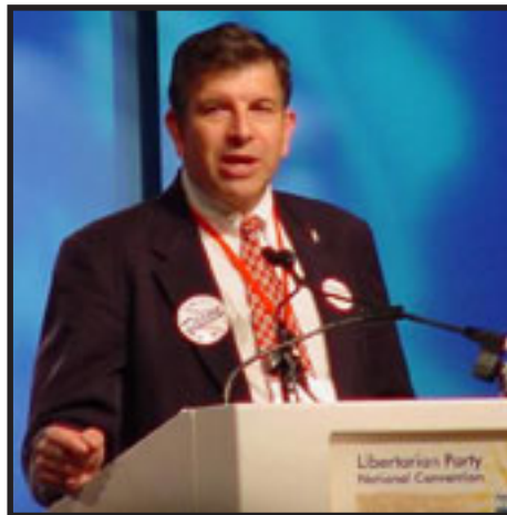
Michael Badnarik – 2004 Presidential nominee of the Libertarian Party, & FSP Member.